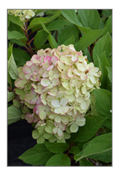
Fire Light Tidbit Hydrangea flowers