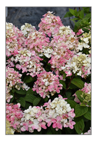
Fire Light Tidbit Hydrangea flowers (faded)