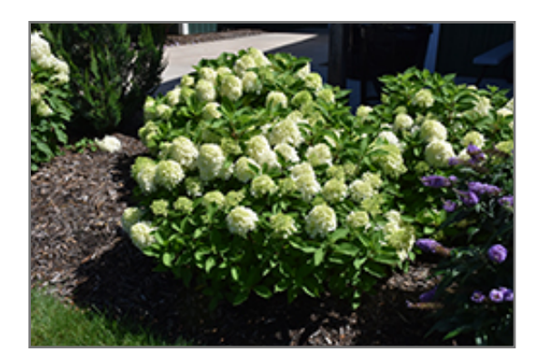
Fire Light Tidbit Hydrangea in bloom

This shrub performs well in both full sun and full shade. It prefers to grow in average to moist conditions, and shouldn't be allowed to dry out. It is not particular as to soil type or pH. It is highly tolerant of urban pollution and will even thrive in inner city environments, and will benefit from being planted in a relatively sheltered location. Consider applying a thick mulch around the root zone in both summer and winter to conserve soil moisture and protect it in exposed locations or colder microclimates. This is a selected variety of a species not originally from North America.