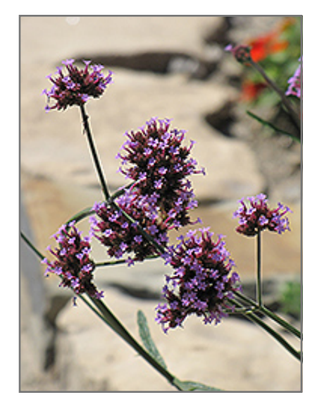
Tall Verbena flowers