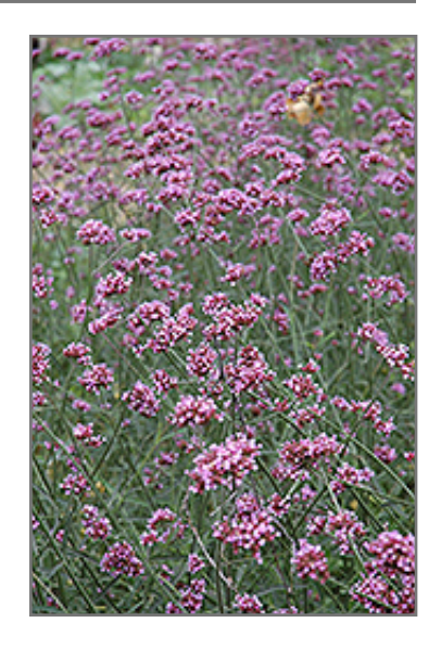
Tall Verbena flowers