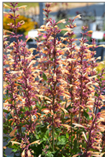
Meant To Bee Queen Nectarine Anise Hyssop flowers

Meant To Bee Queen Nectarine Anise Hyssop is recommended for the following landscape applications;