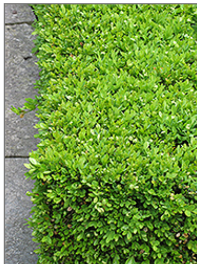
Green Velvet Boxwood foliage