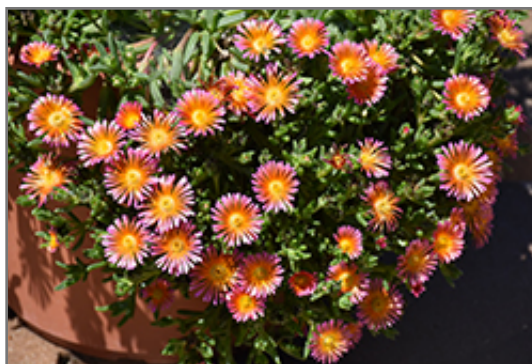
Ocean Sunset Orange Glow Ice Plant flowers