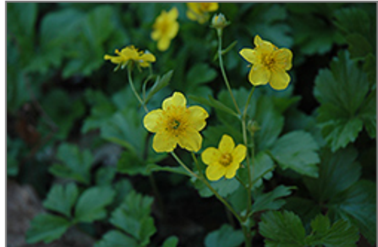
Barren Strawberry flowers