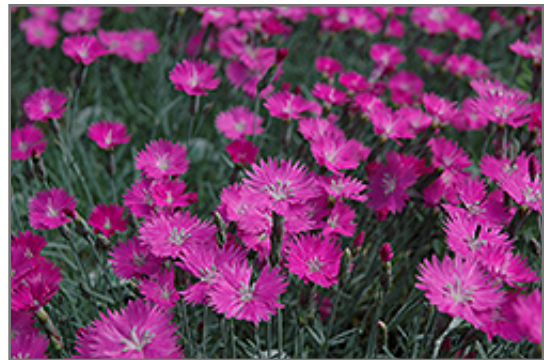
Firewitch Pinks flowers