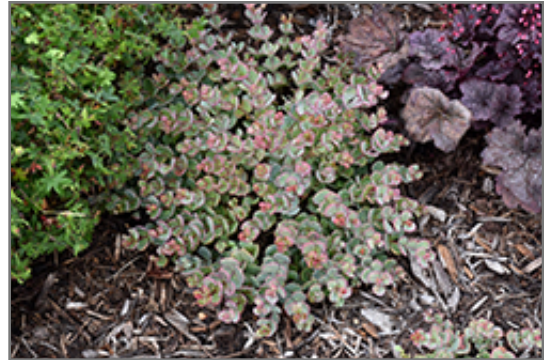
October Daphne