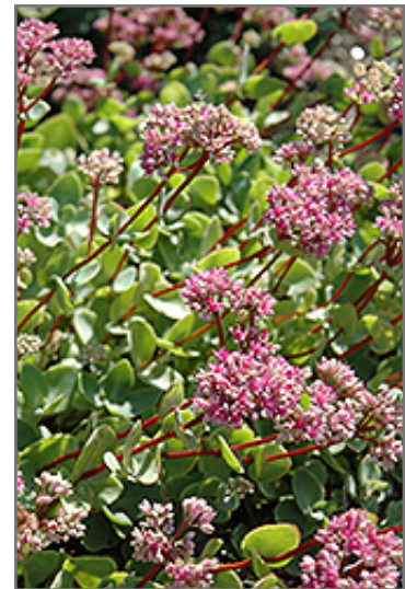
October Daphne flowers