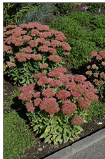
Autumn Fire Stonecrop in bloom