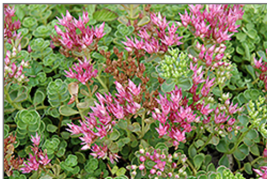
John Creech Stonecrop flowers