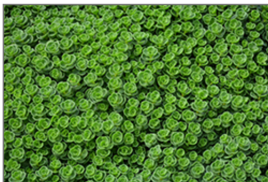
John Creech Stonecrop foliage