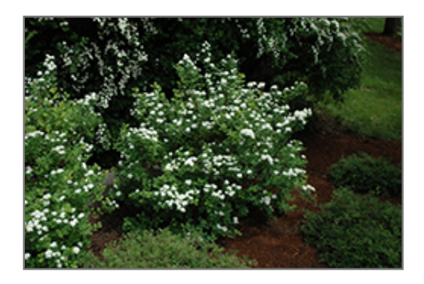
Tor Spirea in bloom