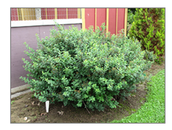
Tor Spirea

* This is a 'special order' plant - contact store for details