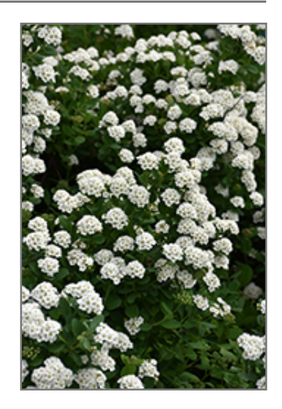
Tor Spirea flowers