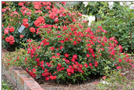
Red Drift Rose in bloom