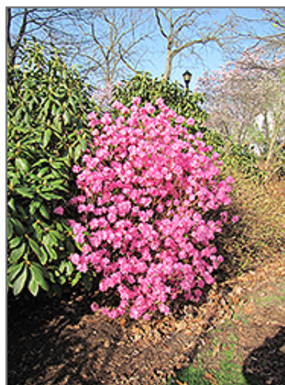
Landmark Rhododendron in bloom