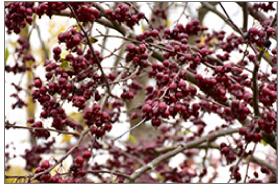
Purple Prince Flowering Crab fruit

This tree should only be grown in full sunlight. It prefers to grow in average to moist conditions, and shouldn't be allowed to dry out. It is not particular as to soil type or pH. It is highly tolerant of urban pollution and will even thrive in inner city environments. This particular variety is an interspecific hybrid.