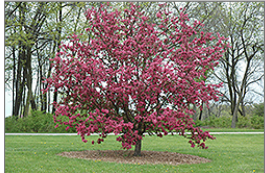
Purple Prince Flowering Crab in bloom