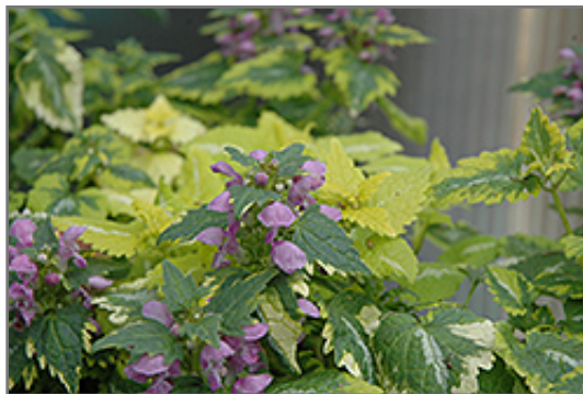
Anne Greenaway Spotted Dead Nettle flowers