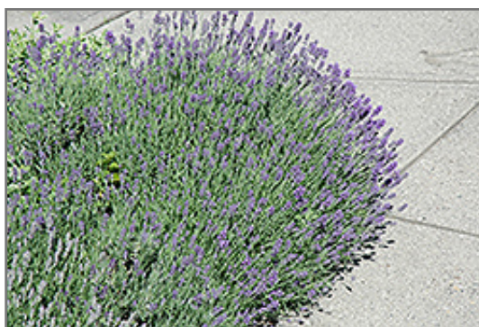
Munstead Lavender in bloom