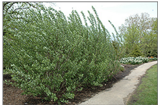
French Pussy Willow