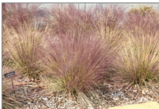
Hairawn Muhly in fall