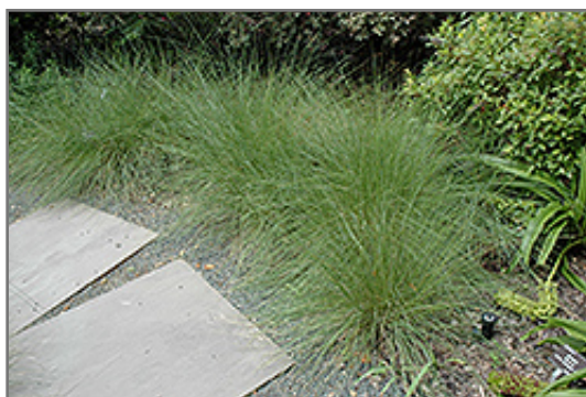
Hairawn Muhly

Hairawn Muhly is recommended for the following landscape applications;