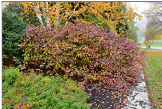
Bailey Red-Twig Dogwood in fall