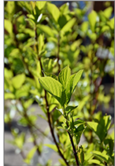
Bailey Red-Twig Dogwood foliage

This shrub does best in full sun to partial shade. It is an amazingly adaptable plant, tolerating both dry conditions and even some standing water. It is not particular as to soil type or pH. It is highly tolerant of urban pollution and will even thrive in inner city environments. This species is native to parts of North America.