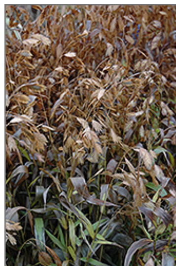
Northern Sea Oats in fall