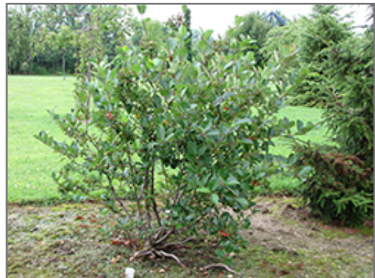
Viking Chokeberry