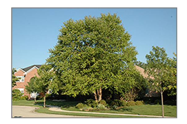
Heritage River Birch