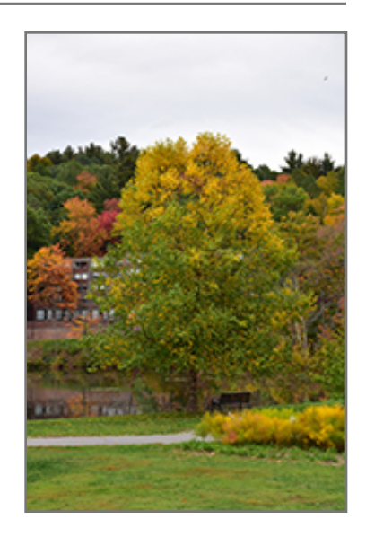
Heritage River Birch in fall

This tree does best in full sun to partial shade. It is quite adaptable, prefering to grow in average to wet conditions, and will even tolerate some standing water. It is not particular as to soil type, but has a definite preference for acidic soils, and is subject to chlorosis (yellowing) of the foliage in alkaline soils. It is highly tolerant of urban pollution and will even thrive in inner city environments. Consider applying a thick mulch around the root zone in winter to protect it in exposed locations or colder microclimates. This is a selection of a native North American species.