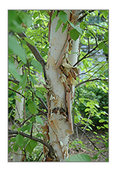
Heritage River Birch bark