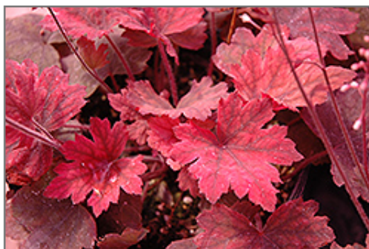
Sweet Tea Foamy Bells foliage

Sweet Tea Foamy Bells will grow to be about 18 inches tall at maturity extending to 24 inches tall with the flowers, with a spread of 24 inches. When grown in masses or used as a bedding plant, individual plants should be spaced approximately 20 inches apart. Its foliage tends to remain dense right to the ground, not requiring facer plants in front. It grows at a medium rate, and under ideal conditions can be expected to live for approximately 10 years.