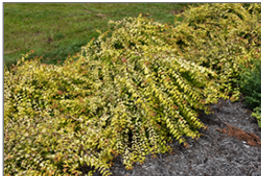
Dream Catcher Beautybush