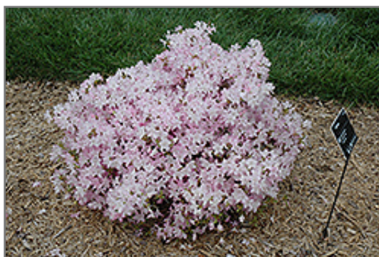
Bubblegum Rhododendron in bloom