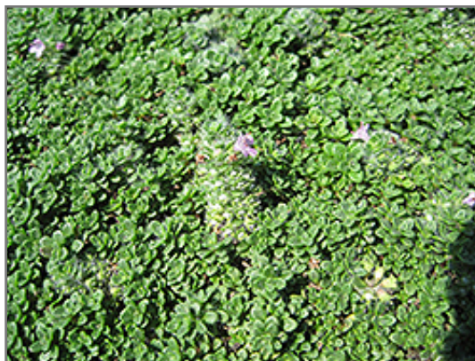
Elfin Creeping Thyme in bloom

Elfin Creeping Thyme is recommended for the following landscape applications;