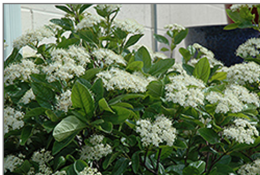
Winterthur Viburnum flowers

Winterthur Viburnum is recommended for the following landscape applications;