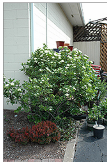
Winterthur Viburnum in bloom