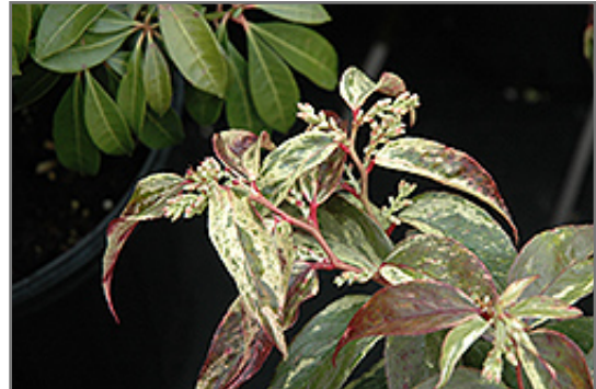
Rainbow Fetterbush foliage

Rainbow Fetterbush is recommended for the following landscape applications;