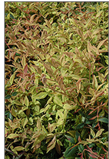
Gulf Stream Dwarf Nandina foliage