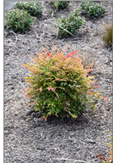
Gulf Stream Dwarf Nandina