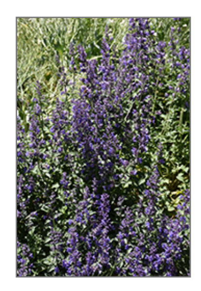
Six Hills Giant Catmint flowers