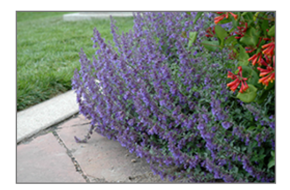
Six Hills Giant Catmint in bloom