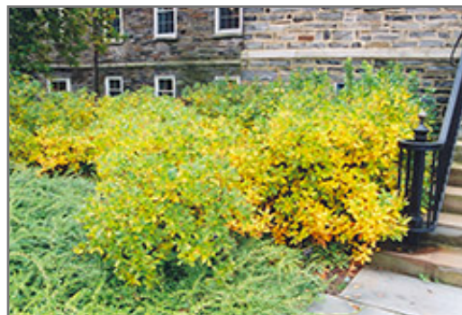
Summersweet in fall