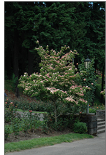
Heart Throb Chinese Dogwood in bloom