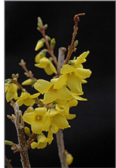
Show Off Forsythia flowers

Show Off Forsythia makes a fine choice for the outdoor landscape, but it is also well-suited for use in outdoor pots and containers. With its upright habit of growth, it is best suited for use as a 'thriller' in the 'spiller-thriller-filler' container combination; plant it near the center of the pot, surrounded by smaller plants and those that spill over the edges. It is even sizeable enough that it can be grown alone in a suitable container. Note that when grown in a container, it may not perform exactly as indicated on the tag - this is to be expected. Also note that when growing plants in outdoor containers and baskets, they may require more frequent waterings than they would in the yard or garden.