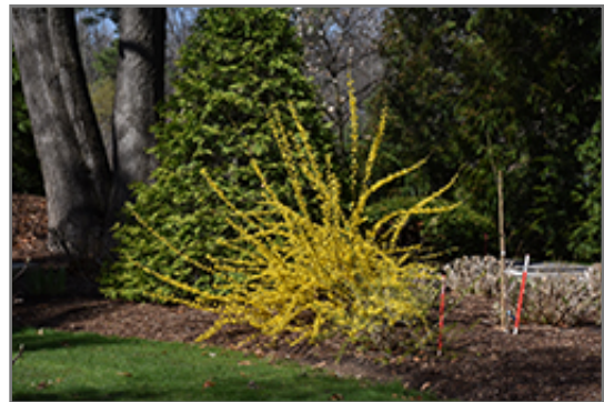
Show Off Forsythia in bloom