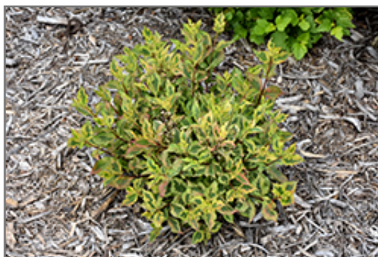
Rainbow Sensation Weigela