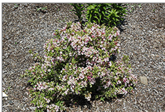
Rainbow Sensation Weigela in bloom