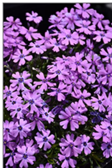
Purple Beauty Moss Phlox flowers

Purple Beauty Moss Phlox is recommended for the following landscape applications;