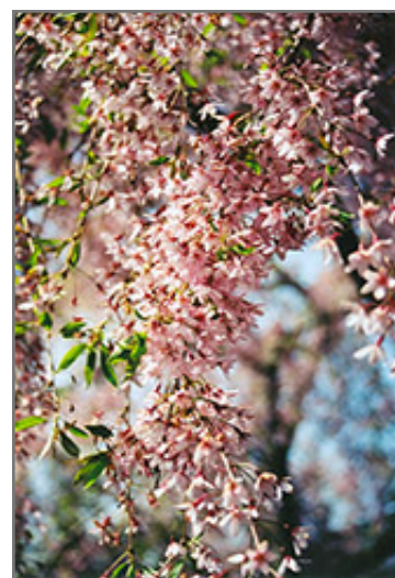
Pink Weeping Higan Cherry flowers