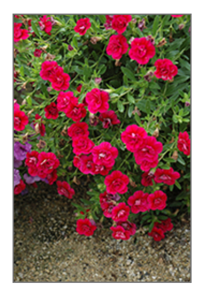
MiniFamous Double Magenta Calibrachoa flowers