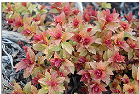
Magic Carpet Spirea foliage