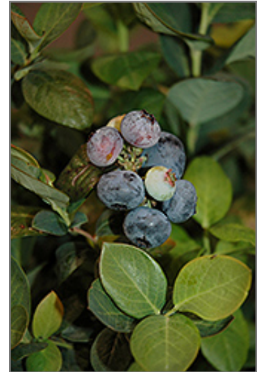
Peach Sorbet Blueberry fruit

Aside from its primary use as an edible, Peach Sorbet Blueberry is suitable for the following landscape applications;