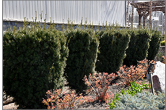
Hicks Yew

This shrub performs well in both full sun and full shade. However, you may want to keep it away from hot, dry locations that receive direct afternoon sun or which get reflected sunlight, such as against the south side of a white wall. It does best in average to evenly moist conditions, but will not tolerate standing water. It is not particular as to soil type or pH. It is highly tolerant of urban pollution and will even thrive in inner city environments, and will benefit from being planted in a relatively sheltered location. Consider applying a thick mulch around the root zone in winter to protect it in exposed locations or colder microclimates. This particular variety is an interspecific hybrid, and parts of it are known to be toxic to humans and animals, so care should be exercised in planting it around children and pets.