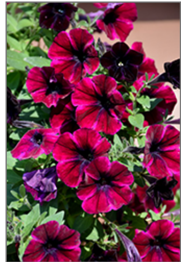
Sweetunia Johnny Flame Petunia flowers