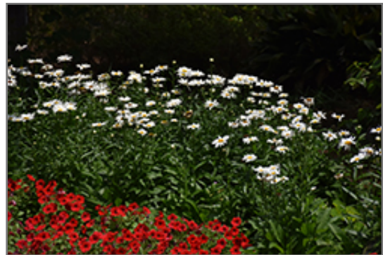
Brightside Shasta Daisy in bloom