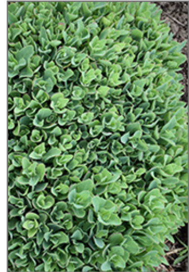
Carl Stonecrop foliage

Carl Stonecrop will grow to be about 16 inches tall at maturity, with a spread of 24 inches. When grown in masses or used as a bedding plant, individual plants should be spaced approximately 18 inches apart. Its foliage tends to remain dense right to the ground, not requiring facer plants in front. It grows at a fast rate, and under ideal conditions can be expected to live for approximately 15 years. As an herbaceous perennial, this plant will usually die back to the crown each winter, and will regrow from the base each spring. Be careful not to disturb the crown in late winter when it may not be readily seen!