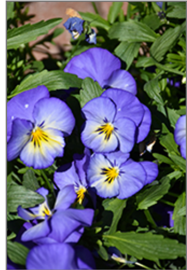
Halo Sky Blue Pansy flowers

Halo Sky Blue Pansy is recommended for the following landscape applications;