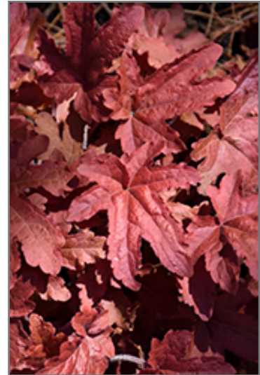
Fun and Games Red Rover Foamy Bells foliage

Fun and Games Red Rover Foamy Bells is recommended for the following landscape applications;