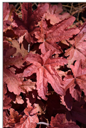
Fun and Games Red Rover Foamy Bells foliage

Fun and Games Red Rover Foamy Bells is recommended for the following landscape applications;