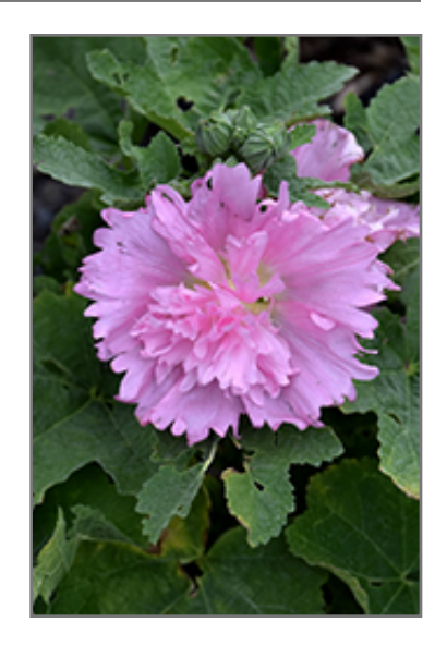
Spring Celebrities Pink Hollyhock flowers