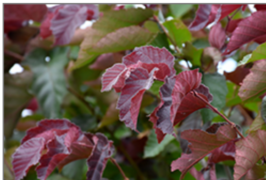
Purpleleaf Bailey Select American Hazelnut foliage

Aside from its primary use as an edible, Purpleleaf Bailey Select American Hazelnut is suitable for the following landscape applications;