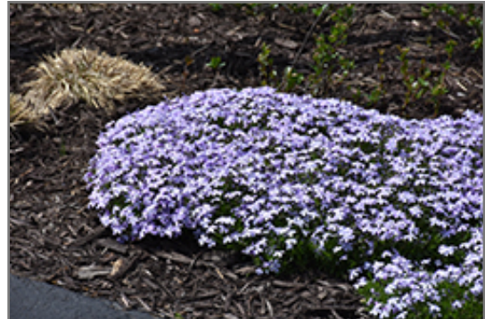
Spring Blue Moss Phlox in bloom

Spring Blue Moss Phlox is recommended for the following landscape applications;