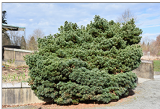
Blue Shag White Pine