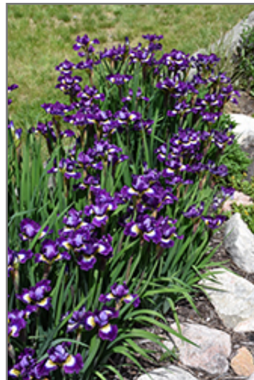
Jewelled Crown Siberian Iris in bloom